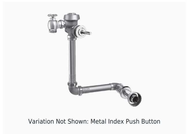
Variation Not Shown: Metal Index Push Button